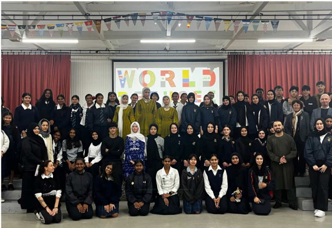
Our Ōtāhuhu College group joining students from 5 local high schools in Māngere.